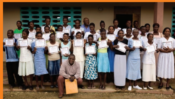
Above and facing page, Fonkoze staff and clients celebrate the first graduating class of Fonkoze's Chemen Lavi Miyò program.