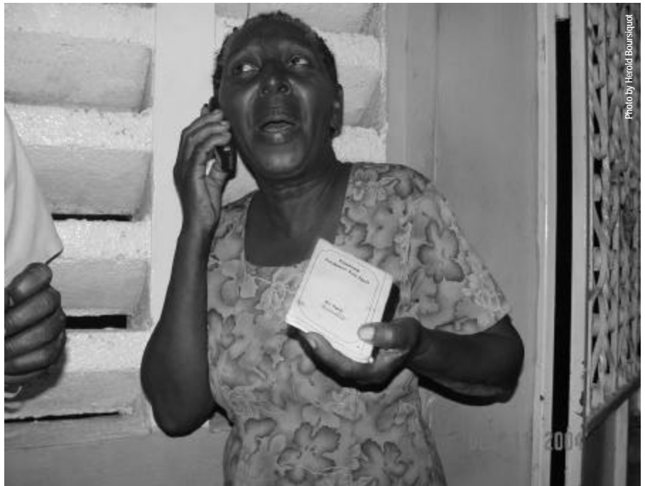
A Fonkoze client phones her family in the U.S.

One elderly man handed over a crumpled piece of envelope with a phone number scribbled on it. He couldn't