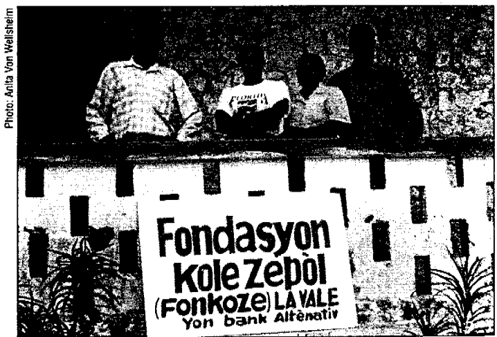
Fonkoze Staff, Lavale Branch